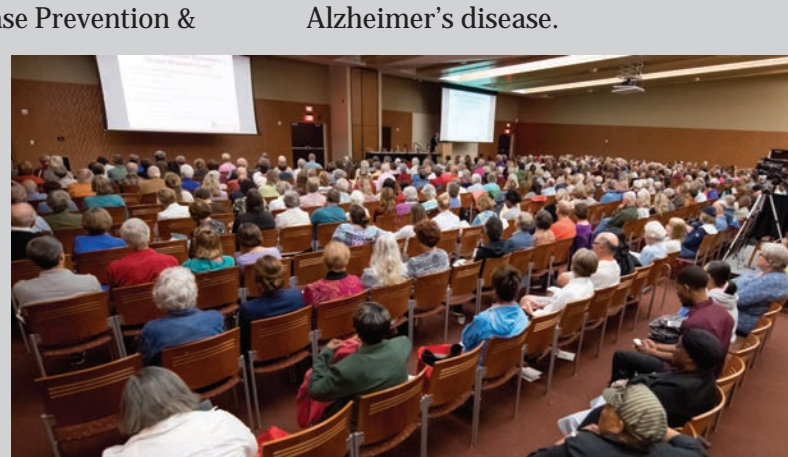
More than 450 people attended the 2017 Annual Fall Lecture on the UW-Madison campus on October 4.

Brain Health," on October 4 at Gordon Dining and Event Center on the UW-Madison campus. Currently, there is no cure for Alzheimer's disease, placing a lot of importance on Alzheimer's disease